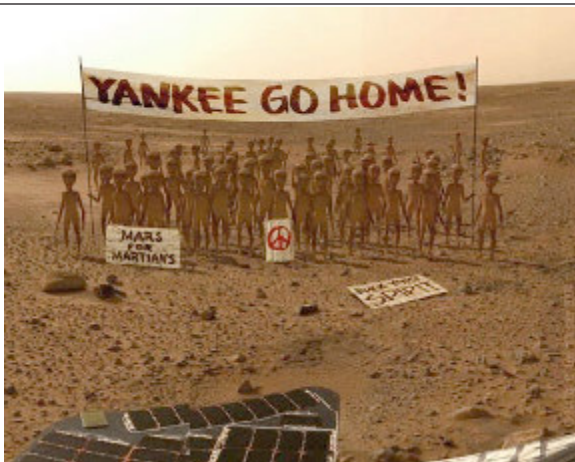
An Exclusive Photo taken from the Mars Rover (notice the Rover's wing at bottom) recently.

Do you know the story of the Marbles of Lord Elgin? Our namesake was involved in a controversy still raging in the hearts of archaeologists.