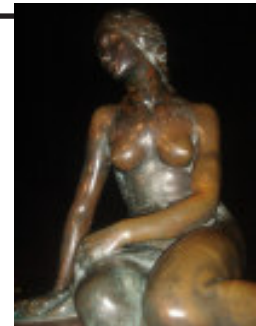
The Little Mermaid